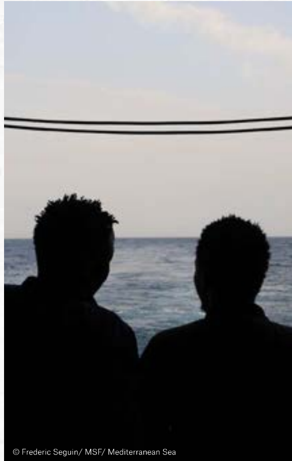
© Frederic Seguin/ MSF/ Mediterranean Sea

MSF patient, October 2023, Mediterranean Sea